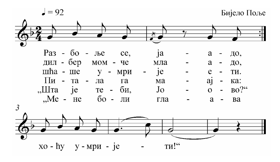
Poor Jovo has fallen ill (a song accompanied by kolo dancing)