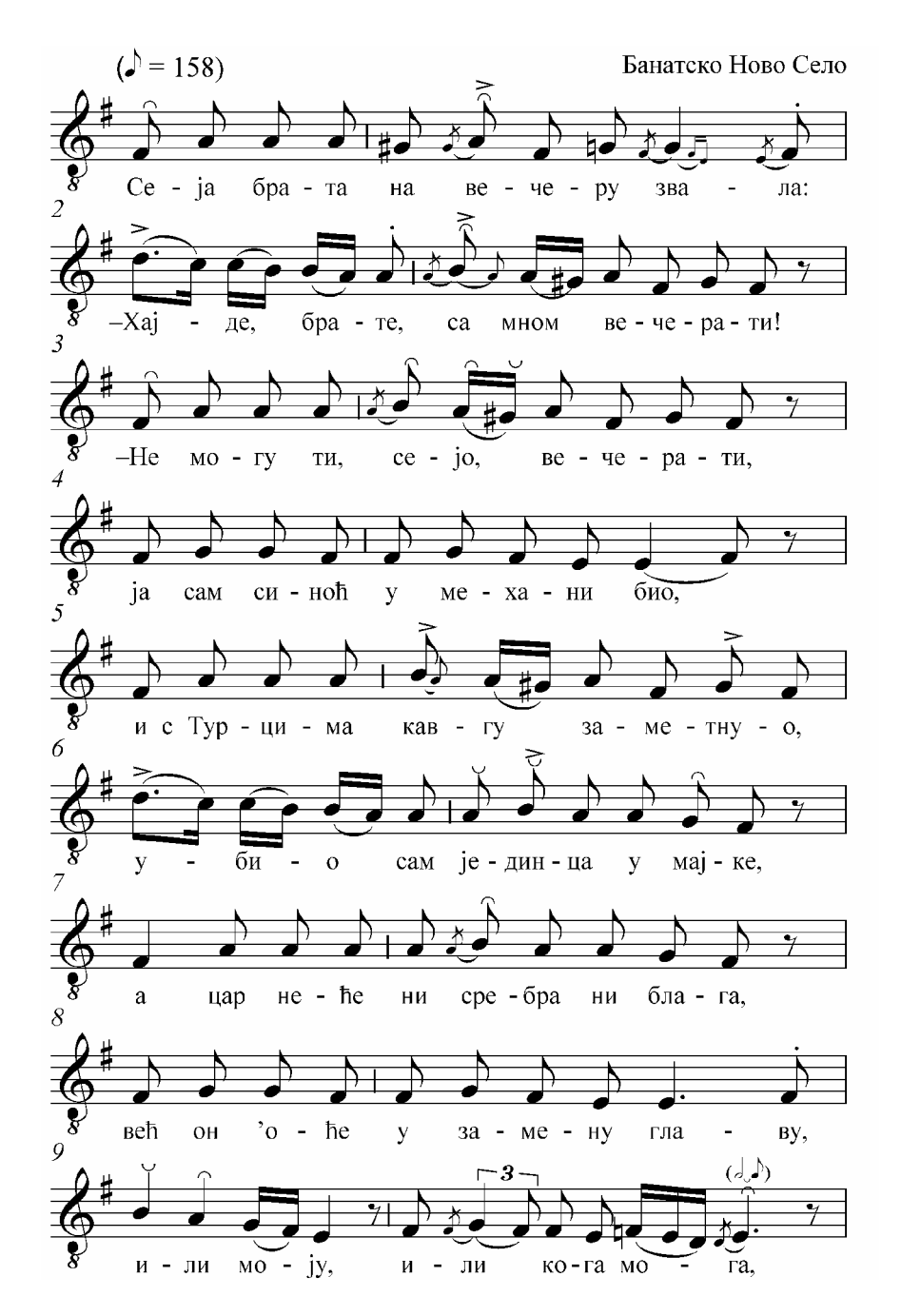
Sister invites her brother for dinner (astalska pesma)